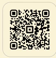
Legacy BRICK 8x8 $100.00