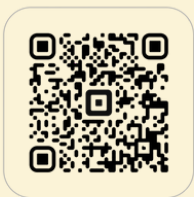
Legacy BRICK 4x8 $50.00